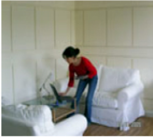
Figure 1. Creating MApps via physical interaction in the Essex iSpace.

consequents. The actions of one rule are only executed if the conditions of the rule are satisfied.